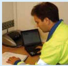
After inspection and service an inspection certificate is issued.