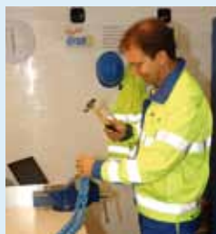
Manufacture of new lifting chains. The products are stocked in the truck.