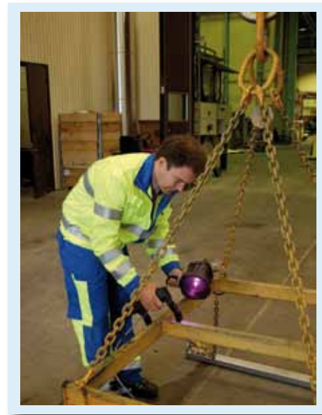
Magna flux inspection of a lifting beam.