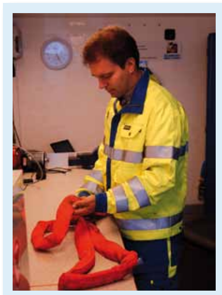
Inspection of roundslings, webbing and webbing slings.