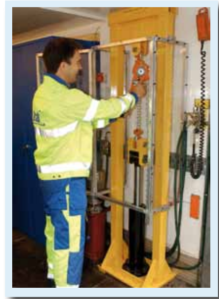
Lever hoists and lifting clamps are proof loaded up to 15 tonnes.