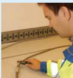
Inspection of steel wire.

When the inspection and service is finished, a inspection survey will be printed on the site.